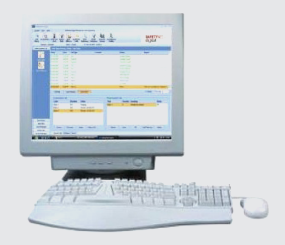
PMR Products SafetyNet Digital Software